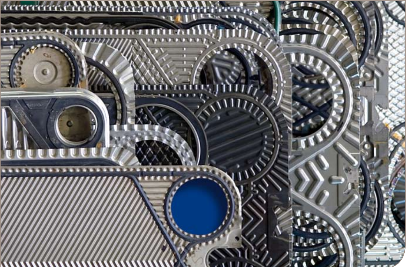
Plate heat exchanger reconditioning packages

Alfa Laval's reconditioning services for plate heat exchangers (PHEs) are organized into three coloured packages: red, yellow and blue. This lets you choose the option that best meets your time, budget and application requirements.