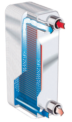
Evaporator, showing flow principle.

In the illustration of a condenser the light and dark blue arrows show the location of the brine connections. The refrigerant flows counter current in the opposite channel and is cooled. The light and dark red arrows indicate the locations of the refrigerant connections.