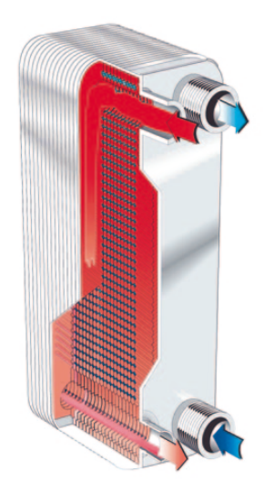
Condenser, showing flow principle.